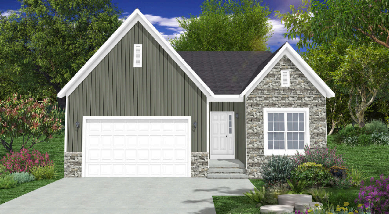
MODERN FARMHOUSE FRONT ELEVATION OPTION