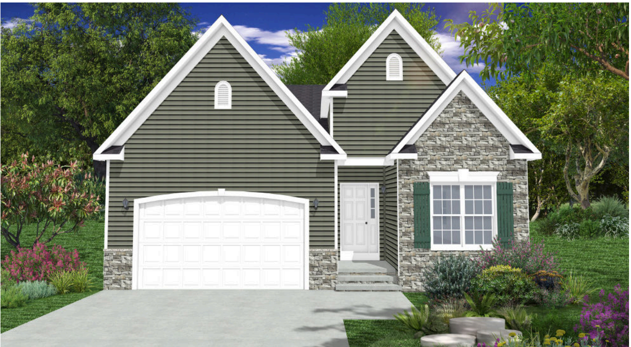
ADDITIONAL GABLE FRONT ELEVATION OPTION #3

Some optional features may be shown or discussed. See ProBuilt sales associate for details and standard features. Floor plans are subject to change. This rendering and floor plans are for illustrative purposes only and are not intended to be a part of any purchase agreement or construction contract. In the interest of continued product improvement and the challenge of material availability, builder reserves the right to modify plans, specifications, and standard features without notice. This home plan is the exclusive copyright of ProBuilt Homes, Inc. or the plan designer. All rights reserved. Reproduction of this plan, either in whole or in part, including any form of copying or derivative works therefrom is strictly prohibited.