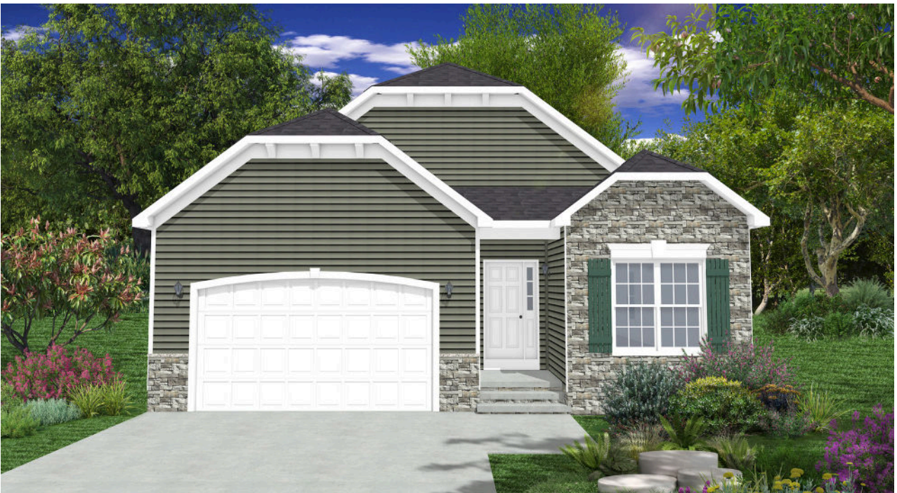
CRAFTSMAN FRONT ELEVATION OPTION

Some optional features may be shown or discussed. See ProBuilt sales associate for details and standard features. Floor plans are subject to change. This rendering and floor plans are for illustrative purposes only and are not intended to be a part of any purchase agreement or construction contract. In the interest of continued product improvement and the challenge of material availability, builder reserves the right to modify plans, specifications, and standard features without notice. This home plan is the exclusive copyright of ProBuilt Homes, Inc. or the plan designer. All rights reserved. Reproduction of this plan, either in whole or in part, including any form of copying or derivative works therefrom is strictly prohibited.