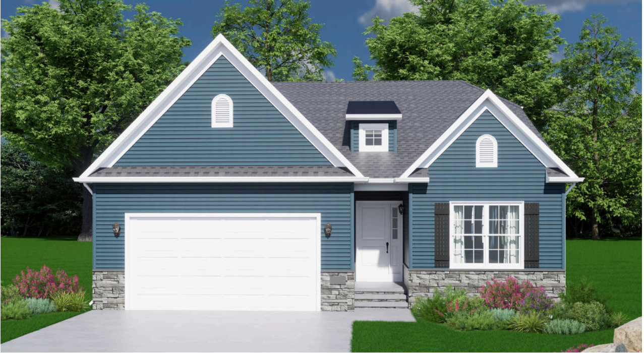
FRONT ELEVATION OPTION #3