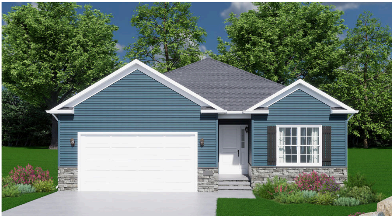
FRONT ELEVATION OPTION #1